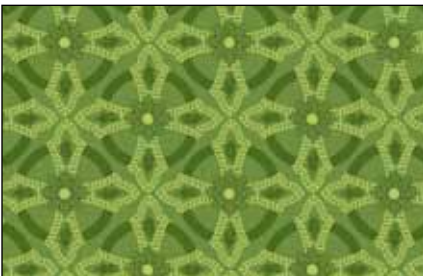
CHIM 529 G*