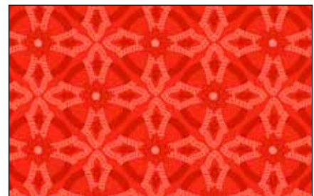
CHIM 529 R*