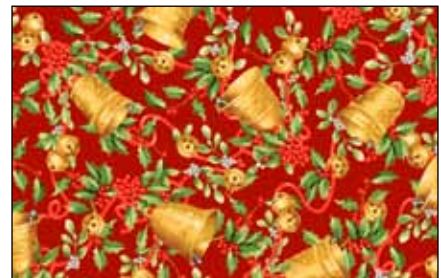
CHIM 527 R*