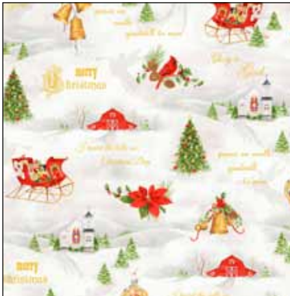
CHIM 525 LS*

Fabric Collection by Sandy Lynam Clough™ for P&B Textiles