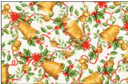
CHIM 527 AU*