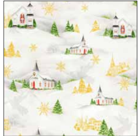
CHIM 528 LS†