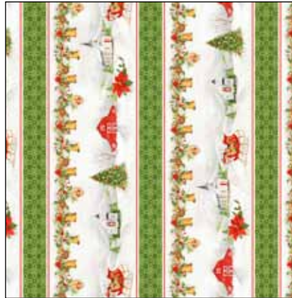
CHIM 526 RG