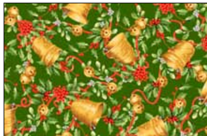
CHIM 527 G*