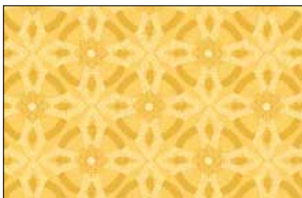
CHIM 529 Y*